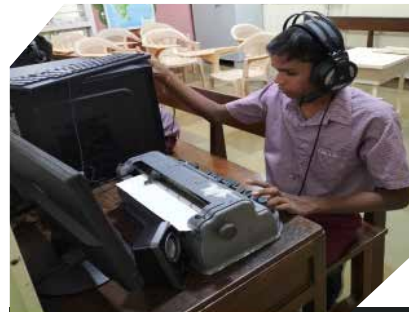
Student using computer to listen to his lesson and is making notes on the Brailier

Students are encouraged to explore the World Wide Web to research on various subjects and prepare assignments/projects on their own on computers. Many of the classes are now equipped with computers.