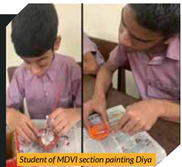
Student of MDVI section painting Diya

The MDVI Section is the functional academic section for the Multiple Disabled Visually Impaired. It prepares students with multiple disabilities with skills to enable them to socialize, become independent and focus on academics. The students are taught Prevocational Skills such as making diyas, torans, chocolates etc.