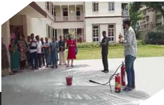
Fire Drill Demonstration for Care Takers