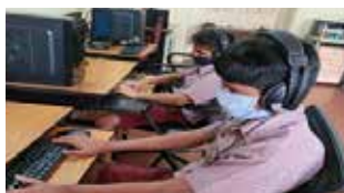
Computer class for school for the Blind

Basic Computer Education for our School Students begins from standard 2. Every student gets a computer exclusively for his practical study. The Computer Course is tailor-made for each student as per his/her aptitude.