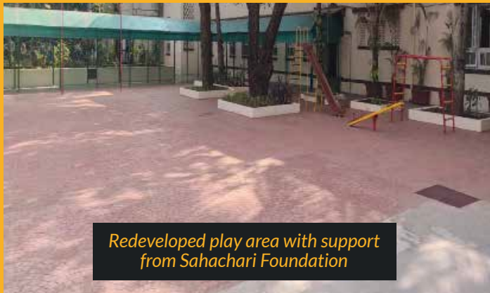
Redeveloped play area with support from Sahachari Foundation