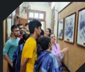
Visit to Mani Bhavan