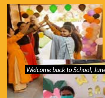
Welcome back to School, June 2022

The Victoria Memorial School for the Blind successfully completed yet another eventful and challenging year with the support and trust of all our well-wishers. Each day during the past one year our supporters and well-wishers surprised us with their constant support and faith in us. Throughout the pandemic period the school ensured that learning continues and best possible services were rendered to our students and other beneficiaries by exploring technological opportunities and providing support in terms of basic needs, educational materials, assistive devices like talking calculator, mobile phones, recharging of phones and so on. As the lock down was gradually lifted post the covid-19 pandemic students eagerly returned and the School became fully operational from March 2022.