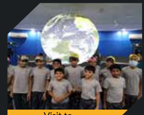
Visit to Nehru Science Centre