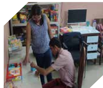
Occupational Therapy session

An educative session for adolescent girl students was held in the area of health and hygiene. The girls were addressed by Dr. Shilpa Agrawal.