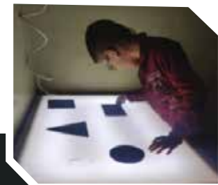
Vision stimulation activity