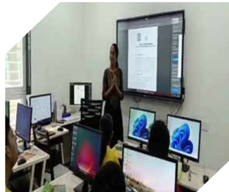
Computer class for Students of Learning Centre

Basic Computer Education for our School Students begins from standard 2. Every student gets a computer exclusively for his practical study. The Computer Course is tailor-made for each student as per his/her aptitude.