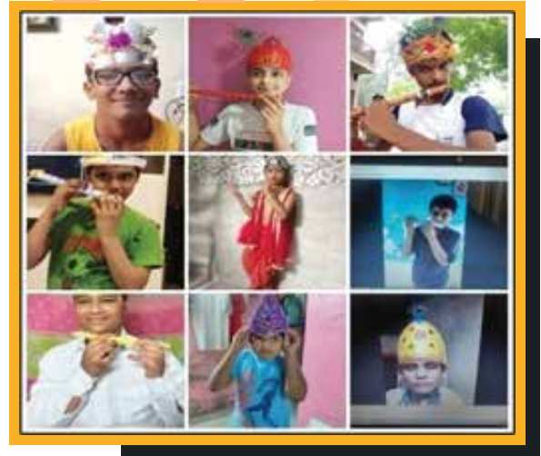
Students Dressed as Krishna for the online Gokul Ashtami Celebration

Parent-Teacher meetings are being conducted online regularly on a one to one basis to coordinate and resolve issues they may be facing personally and in the education of their child. Several families were provided with support by way of food grain supplies and other necessities.