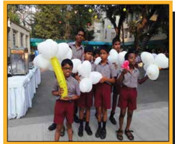
Founders' Day Celebration